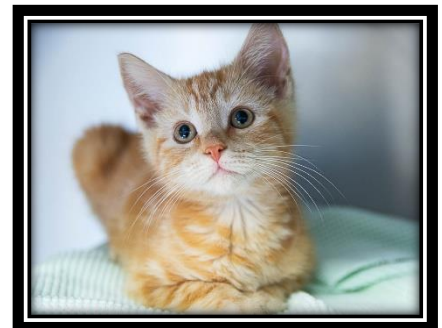
One of the 400 kittens that came to WARL for care this year, an increase from past years.

Wagtime: Saturday, September 28, 2019; 6 pm