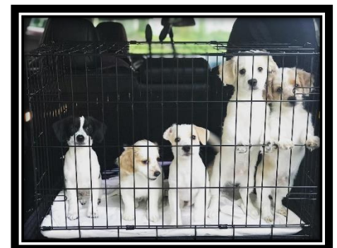
A litter of puppies leaves their foster home for new adventures with new families

Wagtime: Saturday, September 28, 2019; 6 pm