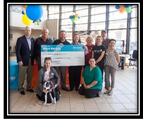
Patrick Subaru donates $33,900 to WARL through the Subaru Share the Love Campaign