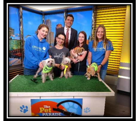
WARL is featured on WBZ's Pet Parade Adoption Segment